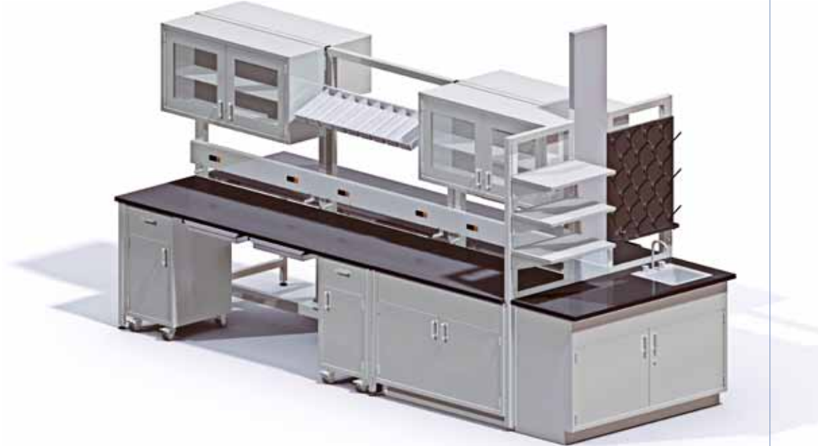
UltraFrame Lab Furniture