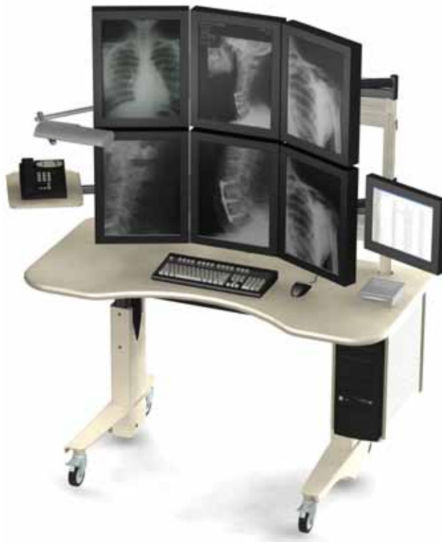
Height Adjustable PACS Picture Archiving Communication System

People who work in the health-care industry do it because of a desire to make a difference in people's lives. Symbiote's focus is to promote work spaces that provide positive interaction in functional environments. It's our job to help the customer create physical spaces that are flexible, modular, mobile and ergonomic.